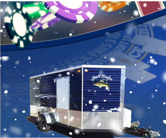
TABLE GAMES ARCTIC ANGLER GIVEAWAY